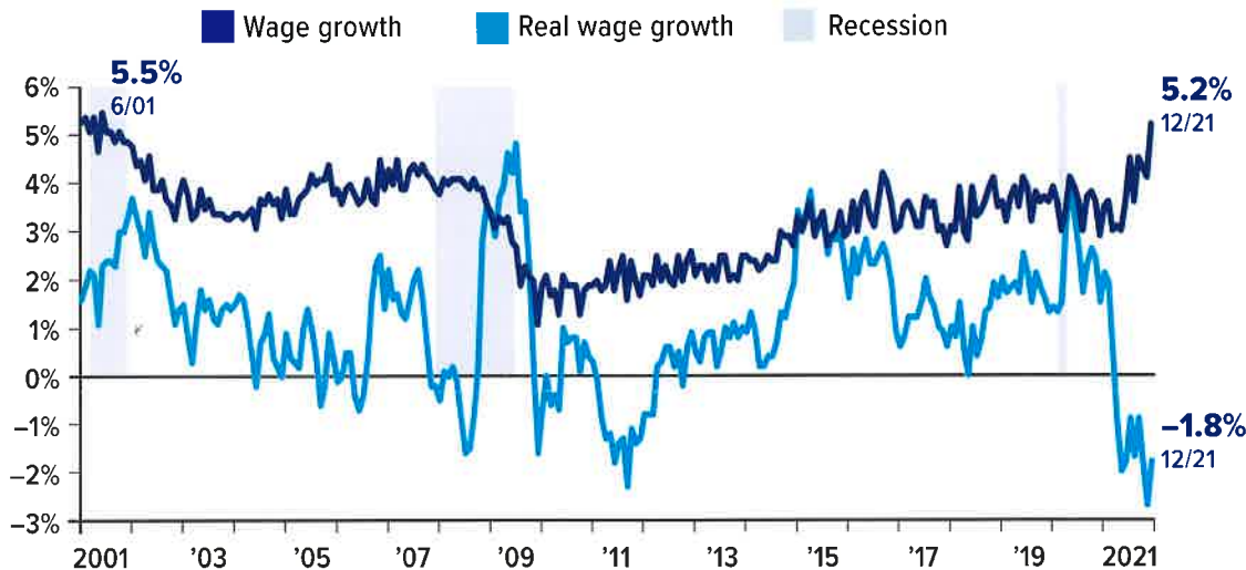
Median hourly wage growth, monthly at an annual rate

(Wage growth is calculated by comparing the median percentage change in wages reported by individuals 12 months apart; real wage growth is calculated by subtracting CPI-U inflation from wage growth.)